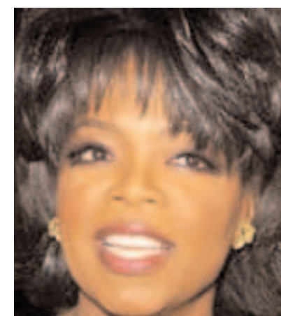
Officer, XM Satellite Radio. "Oprah & Friends is a testament